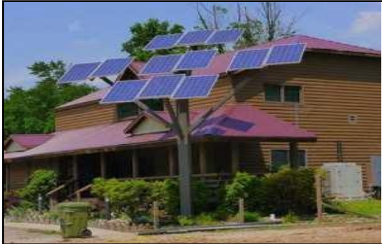
Figure. 1 solar tree structure

of a solar powered Brushless Direct Current (BLDC) motor driven electric vehicle was done. Immanuel selected the appropriate components for the application and the various components for the same are subjected to various tests, cross checked with simulation results.