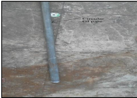
Figure. 4 circular stem

Solar PV modules are mounted on a single tall pole made of Galvanized Iron (GI) pipe having diameter 3 inches and 2 feet height. The branches of the solar tree are made of cast iron and are square in shape. The branches are tilted at an angle of 40-45° for acquiring more amount of sun rays. To get the required power for the small household purpose total of 3 branches are being installed containing solar panels at the tip and the top of the pole consists of one solar panel. The fig. 4 shows the circular stem of the solar tree.