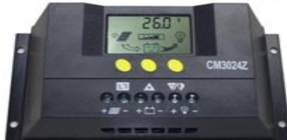
Figure. 6 solar charge controller

A charge controller, charge regulator or battery regulator limits the rate at which electric current is added to or drawn from electric batteries. It prevents overcharging and may protect against overvoltage, which can reduce battery performance or lifespan, and may pose a safety risk. It may also prevent completely draining a battery or perform controlled discharges, depending on the battery technology to protect battery life. The fig. 6 shows the solar charge controller.