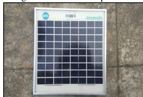
Figure. 3 solar panel

A solar panel is a series of interconnected silicon cells joined together to form a circuit. In greater numbers the amount of power produced by these interconnected cells can be increased and used as an electricity production system. Solar panels come in different sizes for different purposes. Monocrystalline solar panels are slightly more expensive, but also slightly more space-efficient. If there is one poly-crystalline and one monocrystalline solar panel, both rated 220-watt, it would generate the same amount of electricity, but the one made of mono-crystalline silicon would take up less space. Fig. 3 shows the solar panel used.