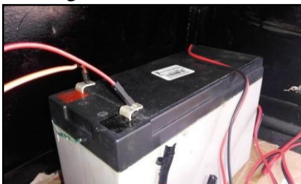
Figure. 5 lead acid battery

Here the use of 12V lead acid batteries is made. Despite having a very low energy to weight ratio and a low energy to volume ratio, its ability to supply high surge currents means that the cells have a relatively large power to weight ratio. These features, along with low cost, make it attractive. As battery used here is of less cost compared to newer technologies, lead acid batteries are widely used even when surge current is not important and other designs could provide higher energy densities. Large format lead acid designs are widely used for storage in backup power supplies in cell phone towers. Due to this reason lead acid battery is selected for storing of power from the solar panel. The fig. 5 shows the lead acid battery.