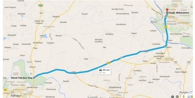
Fig. 4.1: Project Location Map

In this chapter the road section is considered and analysis work including the equipment estimation is carried out for earthwork and paving operation with respect to the section. The location map is as shown in fig.4.1. The planning programme is studied and bar charts are generated which includes in following pages.