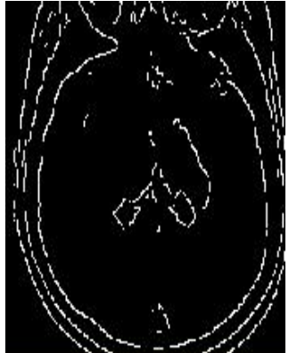
Figure 5.2- Edge Detection