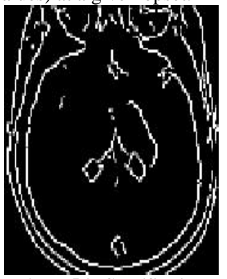
Figure 5.3- Classification

Order is utilized to recognize if the given picture is whether influenced by tumor or not. The information appropriation of each class ought to be considered when dividing cerebrum tumor. Since information dissemination of various classes may generally shift. The proposed grouping strategy depends on dark level co-event classifier. The co-event network or co-event conveyance is a lattice that is characterized over a picture to be the dissemination of cohappening pixel values(gray scale esteem or shading values) at a given opset.