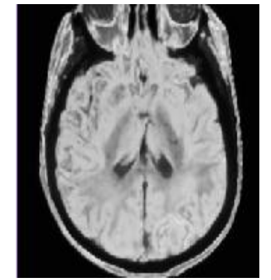
Figure 5.1-Preprocessing of MRI Image

The commotion in the cerebrum expands the multifaceted nature in dividing tumor. The clamor evacuation is fundamental procedure during the time spent division. Commotion can be disposed of by different methodologies some of it incorporates the organizing component, different sorts of channels. The commotion evacuation can diminish the multifaceted nature during the time spent division. The procedure of clamor expulsion is finished by utilizing middle channel. The motivation behind commotion evacuation is to wipe out the clamor without influencing the any component of the picture. The primary reason for existing is to resize the typical picture. It implies the way toward changing over a RGB to Gray. Thus the commotion evacuation process is thought to be fundamental technique in the division procedure.