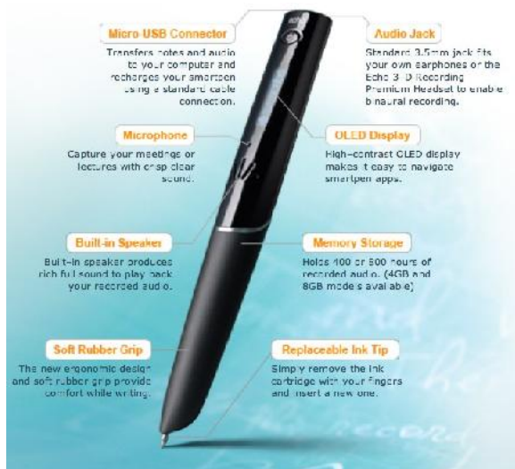
FIGURE.3: Components of a SmartQuill Pen

show while upside down (left hand picture) – only 14 of the 26 letters of the alphabet were usable. These 14 characters were then processed by anagram software to produce 900 words that used these characters