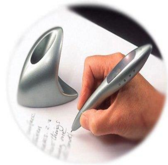
Figure.2: Writing text using SmartQuill Pen