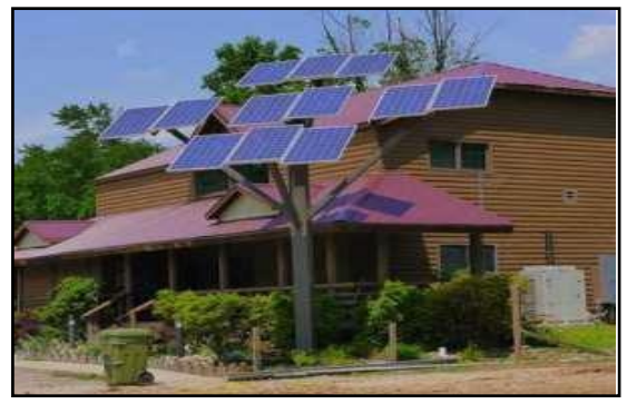
Figure. 1 solar tree structure

of a solar powered Brushless Direct Current (BLDC) motor driven electric vehicle was done. Immanuel selected the appropriate components for the application and the various components for the same are subjected to various tests, cross checked with simulationresults.