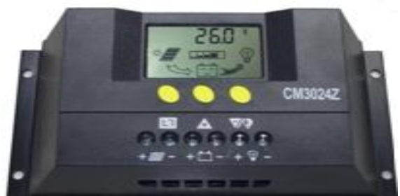
Figure. 6 solar charge controller

3.4. Solar ChargeController A charge controller, charge regulator or battery regulator limits the rate at which electric current is added to or drawn from electric batteries. It prevents overcharging and may protect against overvoltage, which can reduce battery performance or lifespan, and may pose a safety risk. It may also prevent completely draining a battery or perform controlled discharges, depending on the battery technology to protect battery life. The fig. 6 shows the solar chargecontroller.