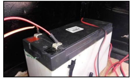
Figure. 5 lead acid battery

Here the use of 12V lead acid batteries is made. Despite having a very low energy to weight ratio and a low energy to volume ratio, its ability to supply high surge currents means that the cells have a relatively large power to weight ratio. These features, along with low cost, make it attractive. As battery used here isof less cost compared to newer technologies, lead acid batteries are widely used even when surge current is not important and other designs could provide higher energy densities. Large format lead acid designs are widely used for storage in backup power supplies in cell phone towers. Due to this reason lead acid battery is selected for storing of power from the solar panel. The fig. 5 shows the lead acid battery.