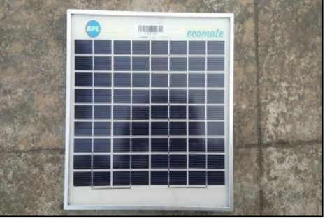
Figure. 3solar panel

A solar panel is a series of interconnected silicon cells joined together to form a circuit. In greater numbers the amount of power produced by these interconnected cells can be increased and used as an electricity production system. Solar panels come in different sizes for different purposes. Monocrystalline solar panels are slightly more expensive, but also slightly more spaceefficient. If there is one poly-crystalline and one monocrystalline solar panel, both rated 220-watt, it would generate the same amount of electricity, but the one made of mono-crystalline silicon would take up less space. Fig. 3 shows the solar panel used.