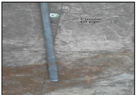
Figure. 4 circular stem

Solar PV modules are mounted on a single tall pole made of Galvanized Iron (GI) pipe having diameter 3 inches and 2 feet height. The branches of the solar tree are made of cast iron and are square in shape. The branches are tilted at an angle of 40-45^{\circ} for acquiring more amount of sun rays.To get the required power for the small household purpose total of 3 branches are being installed containing solar panels at the tip and the top of the pole consists of one solar panel. The fig. 4 shows the circular stem of the solar tree.